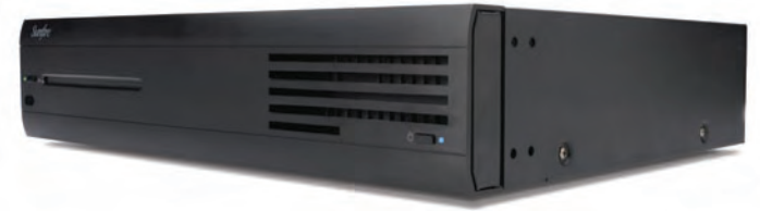
TGM-100C Media Client

Your entire collection of music and movies — all at your fingertips.