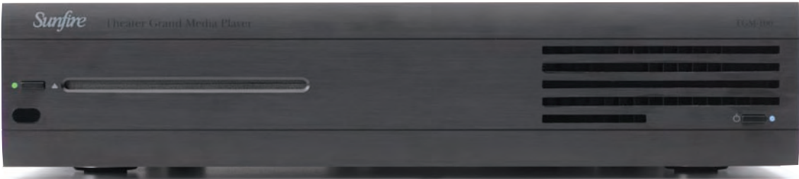
TGM-100 Media Server

EASILY ACCESS YOUR FAVORITES USING AN INTUITIVE ON-SCREEN INTERFACE