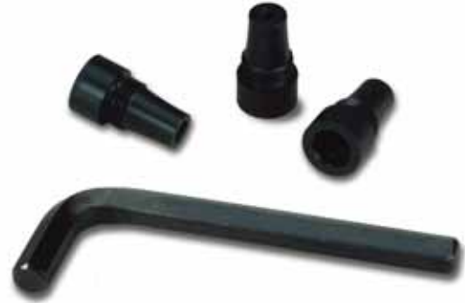
“Quick-Change” Jet Nozzle