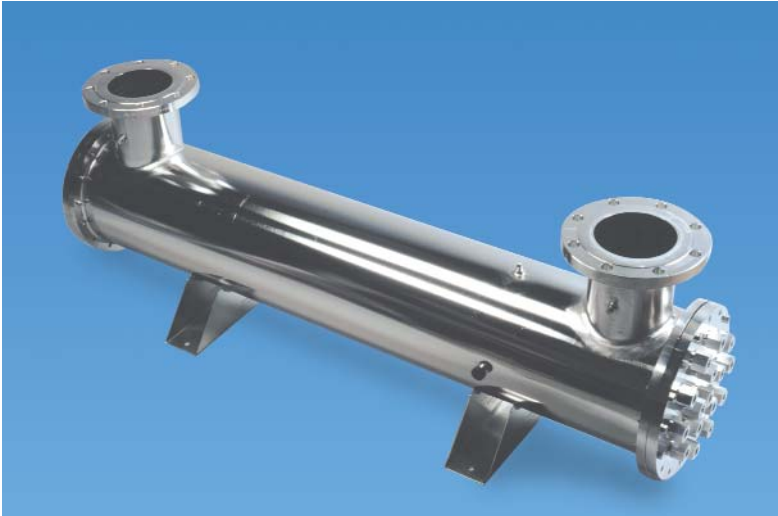
Hydro-Safe® High Capacity UV System

High capacity models for flow rates from 40 to 800 GPM.