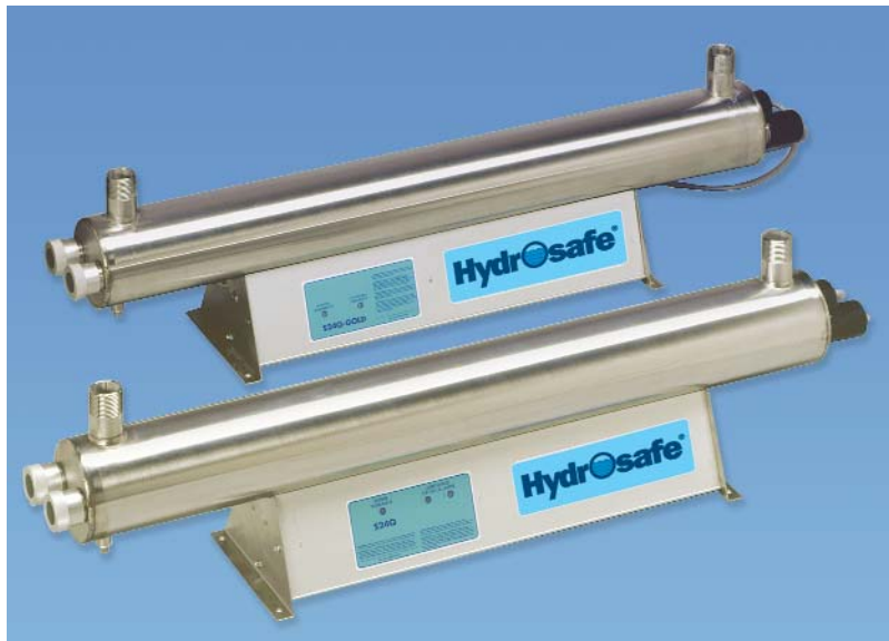
24 GPM Models with monitor

Top quality systems designed to reduce bacteria, virus & other harmful contaminants.