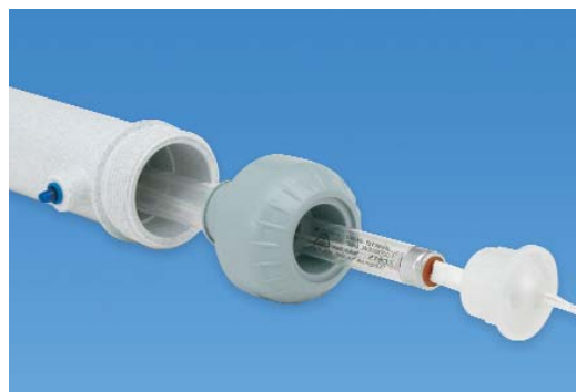
Model PUV-6W with replaceable lamp